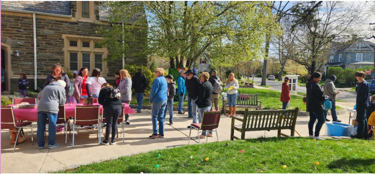
Scenes from our Easter Service